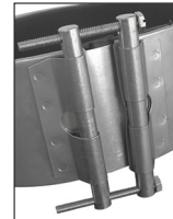
Double Bolt Option

When the connector is tightened the metal sleeve contacts the duct wall to provide rigidity.