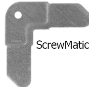
ScrewMatic J Corner